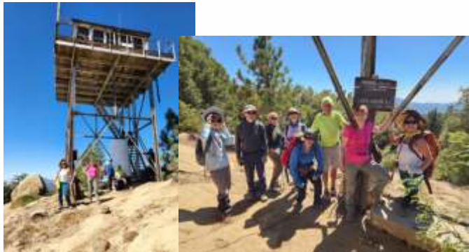
Thorn Point September 30th