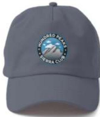
HPS Official... by HPSMerchandise