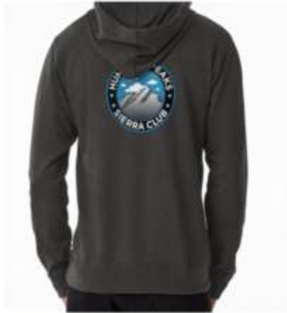
HPS Official... by HPSMerchandise