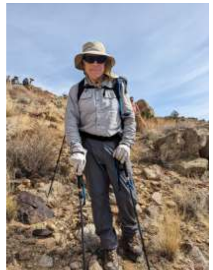
Lary Pond, Martinez Mountain March 12th