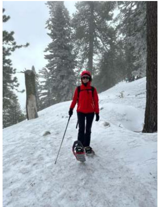
Sunny Y1 March 25th