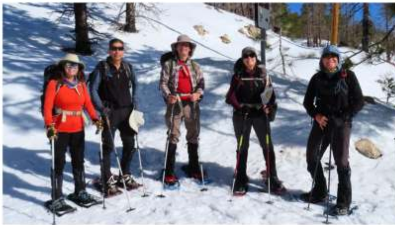
Snow shoeing Angeles Crest. Peaks: Winston and Akawie.

Cover: Sheep Mountain summit. March 9, 2024.