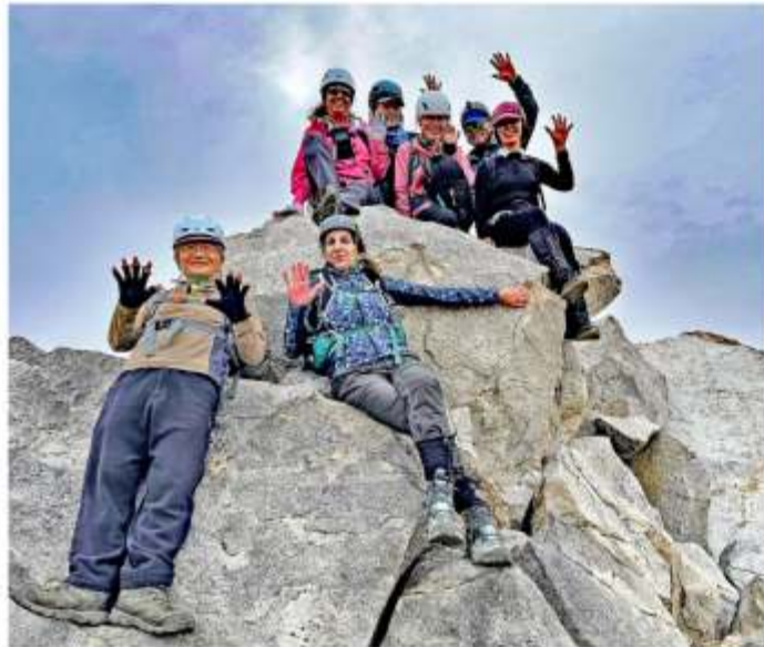
Five Fingers Summit, March 19th.