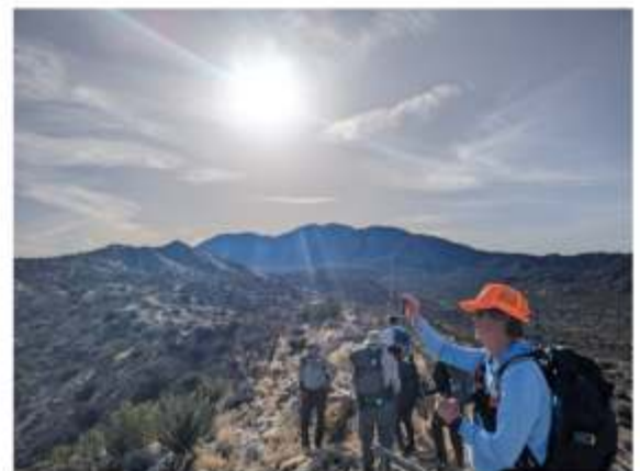
Martinez Mountain in the distance Rabbit Ramp- up hike.