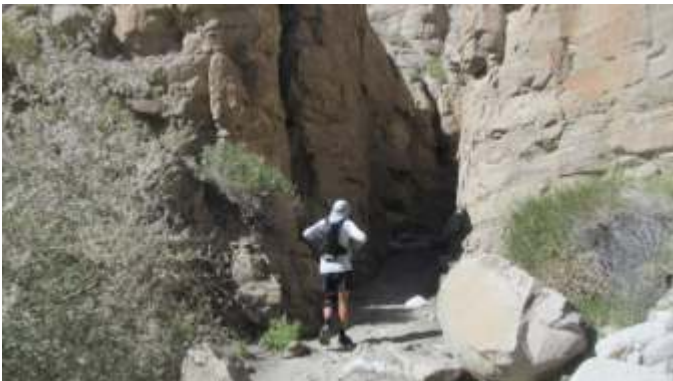
Alann entering the slot