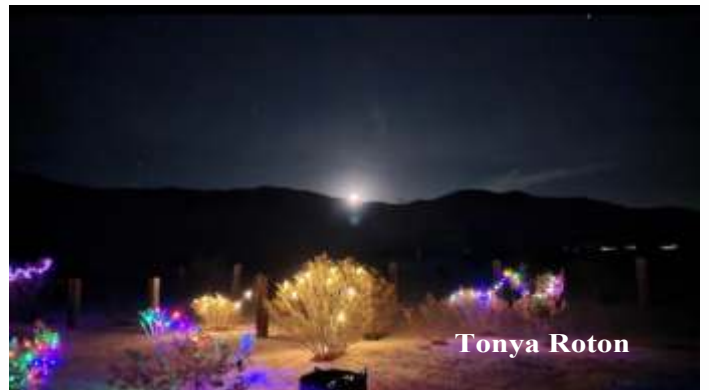
Holiday Hoopla 2023