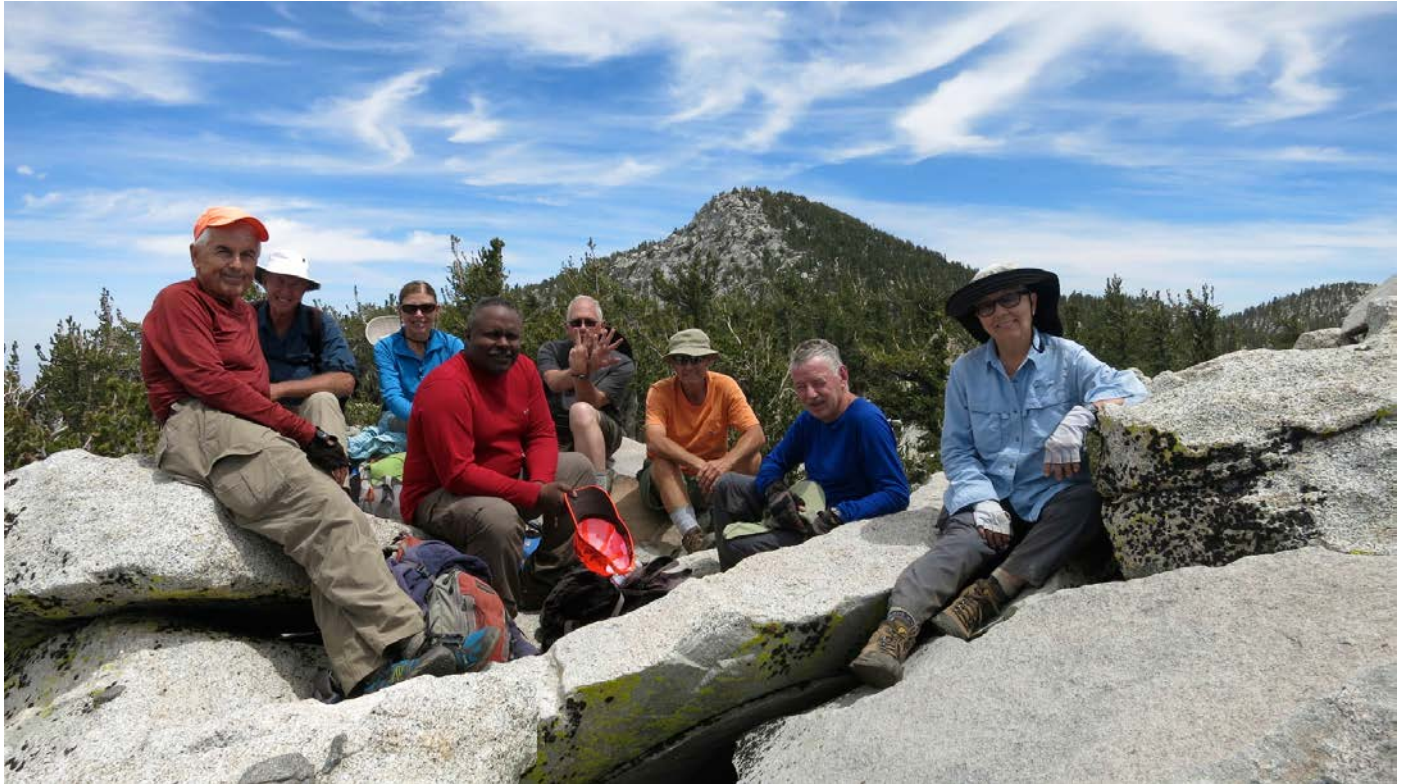
Group on Folly