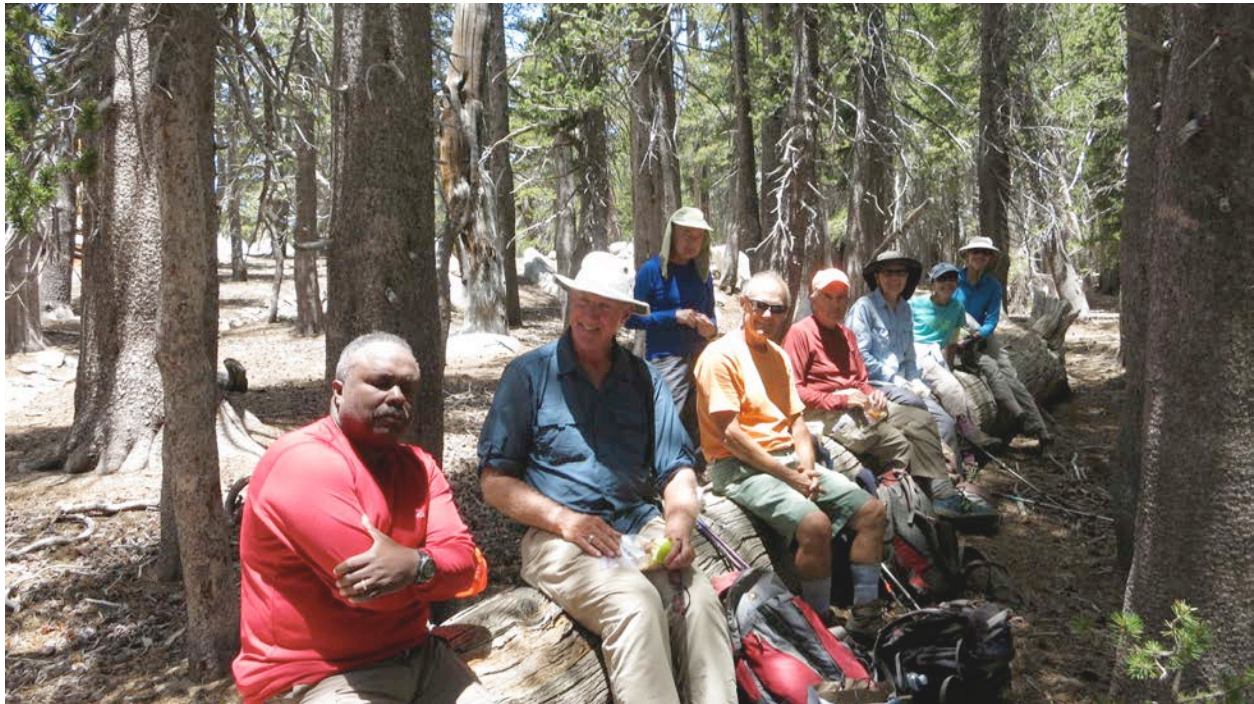
A shady rest spot along the Marion Mountain Trail, on the way to Folly.

Several roads that we frequently use to travel to the trailheads have warnings that headlights must be turned on for daylight use. These include, but are not limited to, sections of the Angeles Crest Highway, Highway 138 near Wrightwood, and highways between Lake Arrowhead and Big Bear. Penalties for failure to observe this requirement are very expensive. Be Safe!! Don't get a ticket! Turn on your headlights where required!