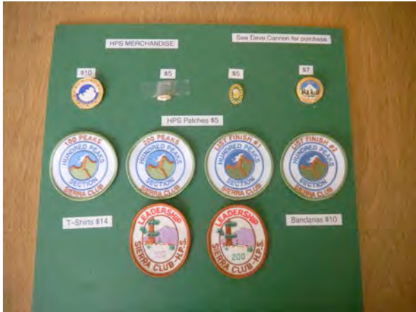
Pins And Patches