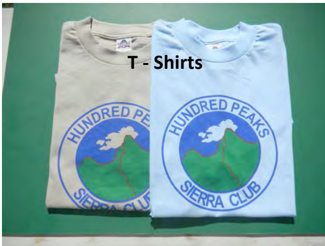
T - Shirts