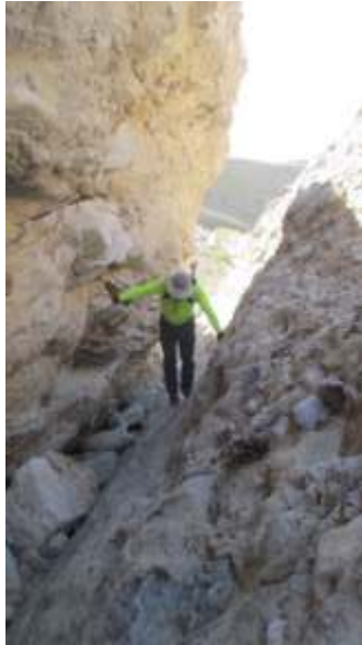
Chuck in Slanted Lycium slot