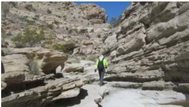
Chuck headed up Lycium