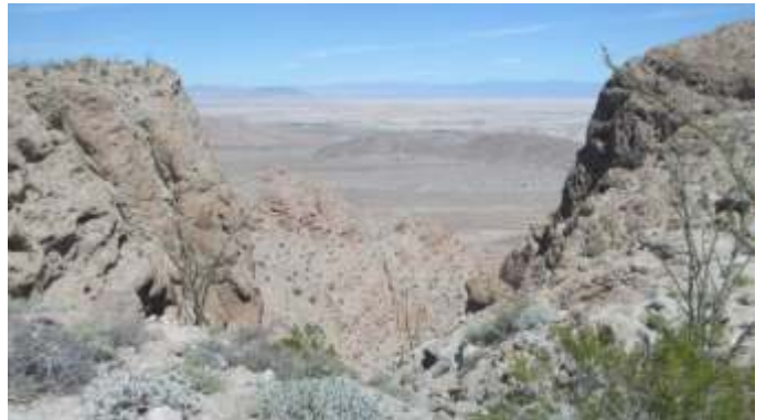
Traveling along the main Split Mountain Ridgeline