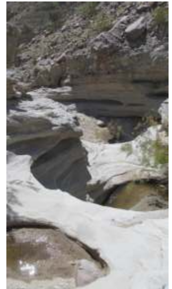
Headed down Oyster Shell