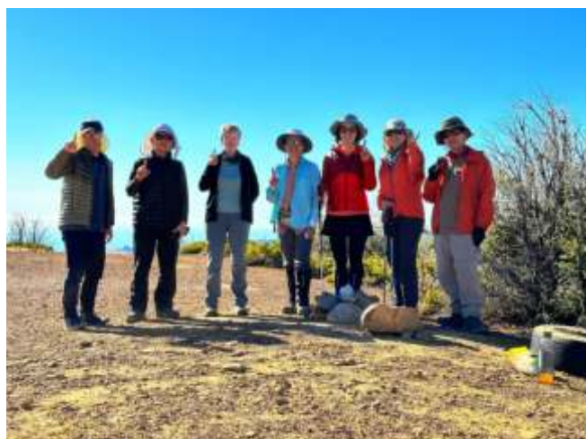
Monte Arido Summit