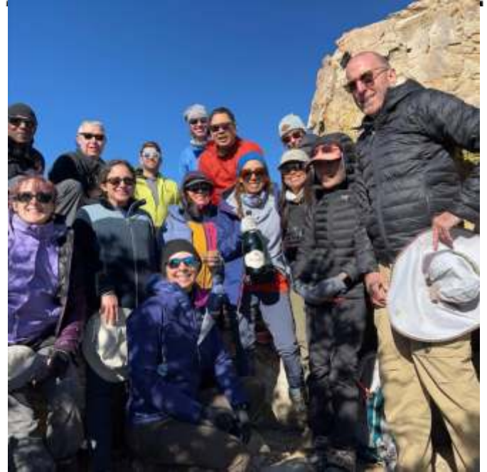
Scodie November 22nd