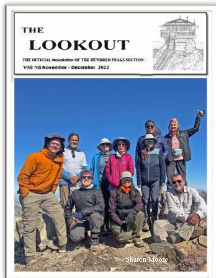
Cover Photo:: Owens Peak.