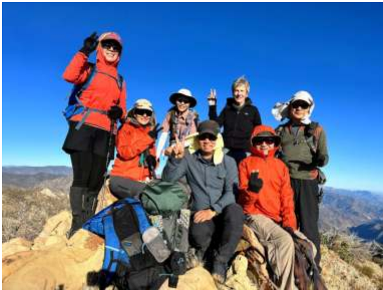
Old Man Mountain Summit Nov 16th