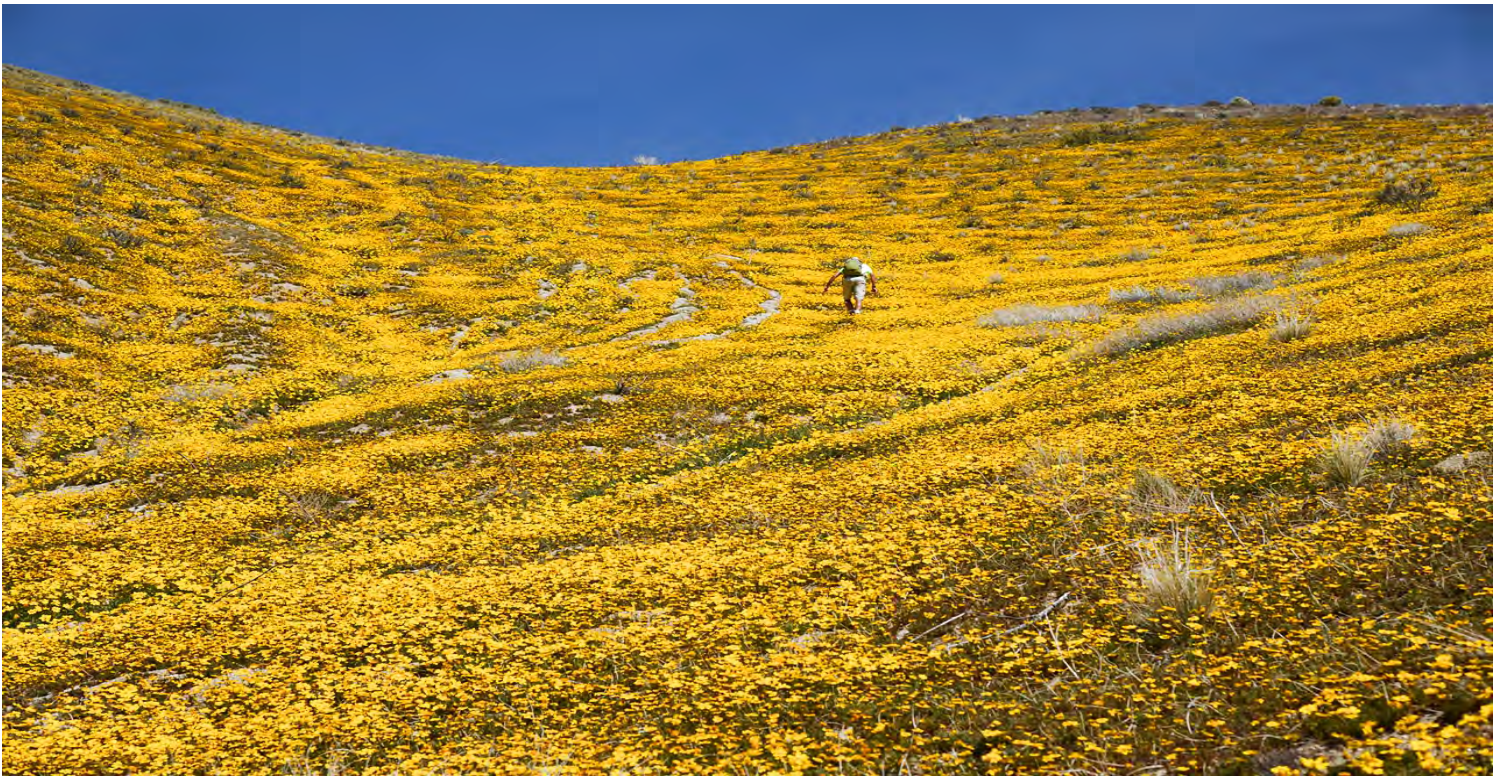
Flowers blazed across the southeast slopes of Onyx #2 as Peter Doggett led, March 2.

Hundred Peaks Section: The Lookout The Sierra Club Angeles Chapter Wayne Vollaire 2035 Peaceful Hills Road Walnut, CA 91789