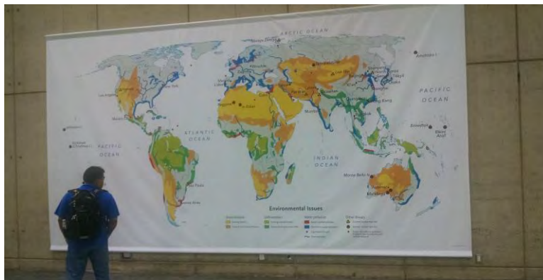
Environmental Issues map– Esri User Conference, San Diego Convention Center

In July, I attended the Esri User Conference in San Diego. With more than 15,000 geospatial professionals in attendance, this conference is heaven for map lovers. I spent hours in the Map Gallery where hundreds of maps were on display. Winning entries from the map competition can be found at: http://www.esri.com/events/user-conference/exhibits/map-gallery-results .