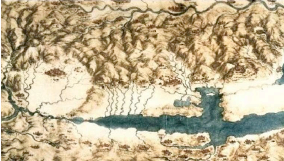
Leonardo da Vinci, Map of Tuscany and the Chiana Valley (circa 1503), in the Royal Collection Trust at Windsor.

Representative of these early maps is Leonardo da Vinci's Map of Tuscany and the Chiana Valley . This map attempts to depict what the hills and valleys actually look like.