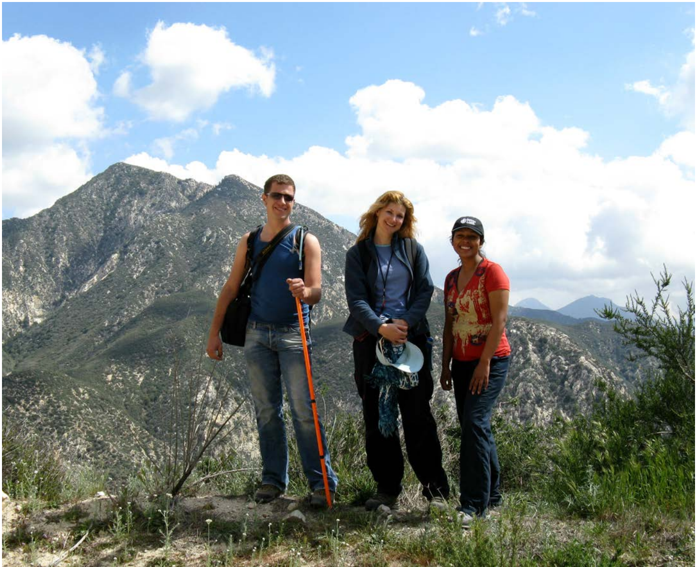
Hikers enjoying the view of the Condor Peak Proposed Wilderness Area

OFFICIAL NEWSLETTER OF THE HUNDRED PEAKS SECTION V52 N3– May - June 2015