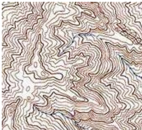
A segment of the Coxcomb Mountains, Joshua Tree National Park.

The USGS maps that we use in our navigation program are intended to help us visualize three-dimensional terrain on a two-dimensional piece of paper. Unfortunately, many map readers have difficulty forming a mental image of the terrain from the contours and often view them as a jumble of indecipherable lines.