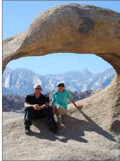
Photo taken in the Alabama Hills, near Lone Pine