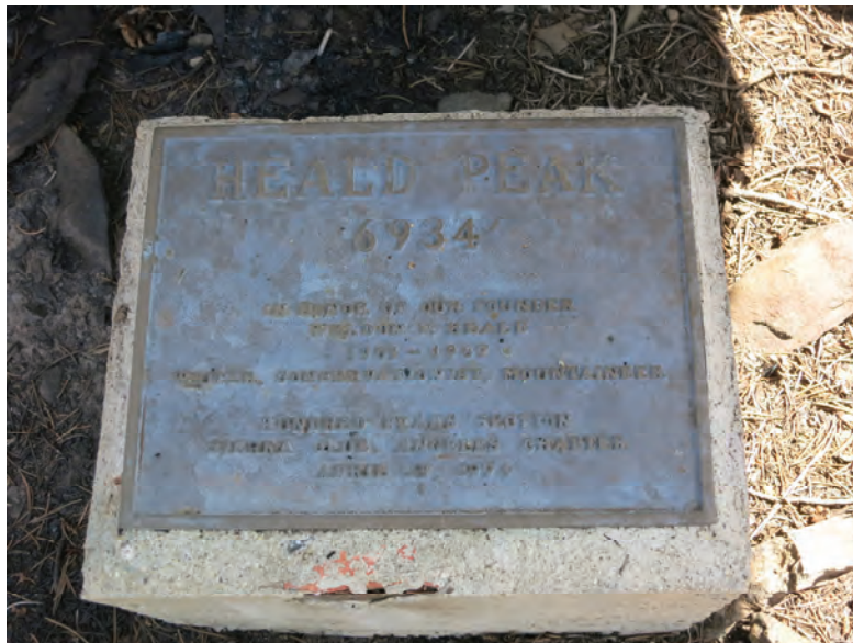
Dedication plaque on Heald Peak