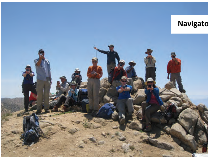
Navigators on the summit of Warren Point, April 20, 2013