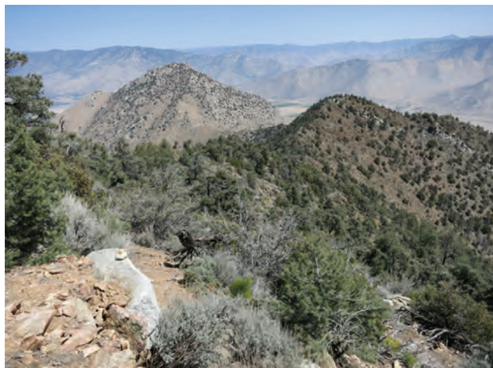
Looking back at Nicolls from the trail to Heald Peak