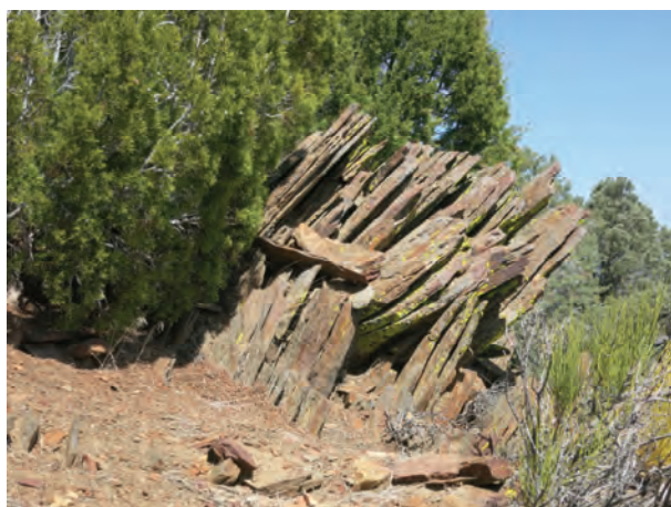
Unusual rock formation along the trail to Heald Peak