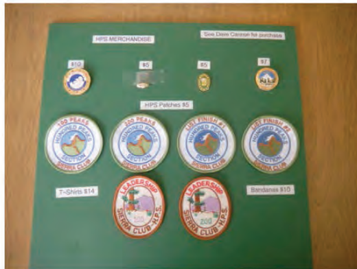
Pins And Patches