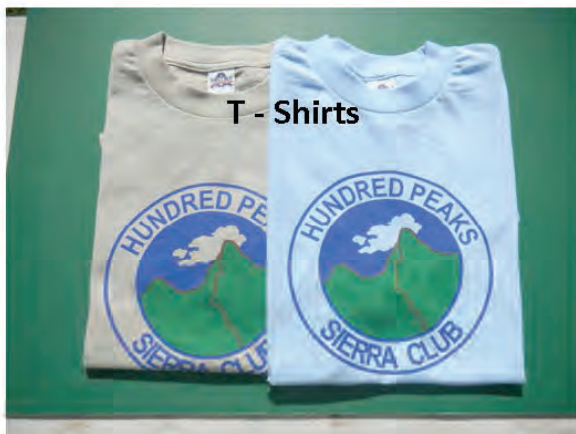
T - Shirts