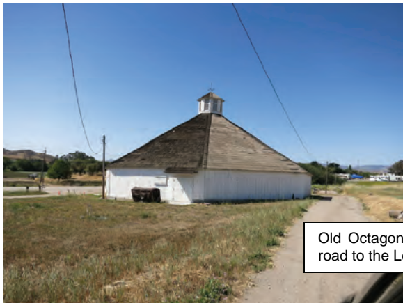
Old Octagonal Barn along the road to the Leverich Ranch