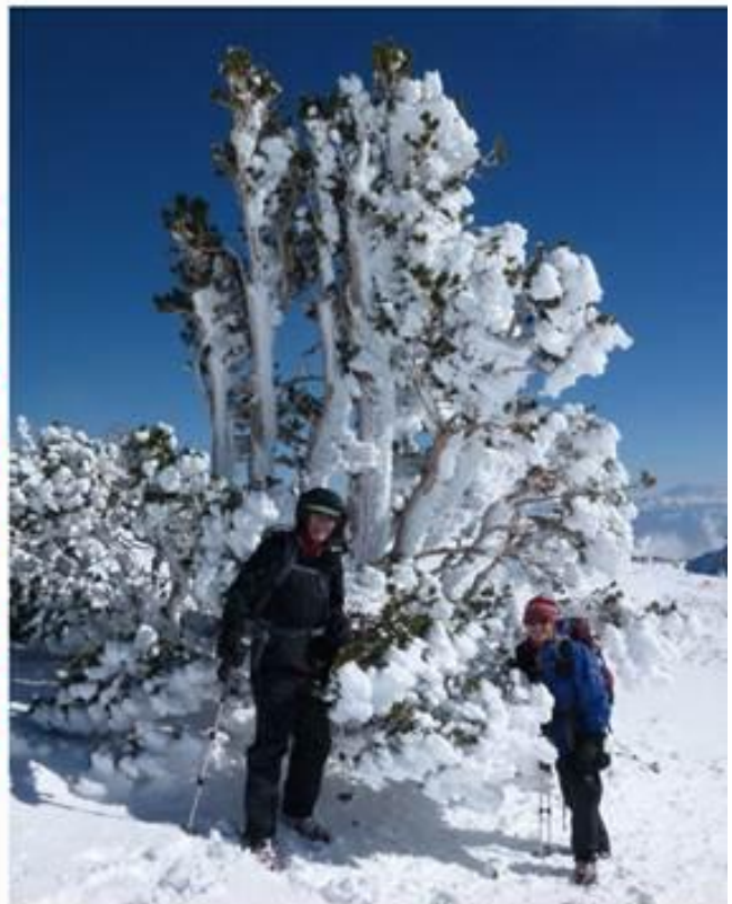
Mount Baldy on December 15, 2012