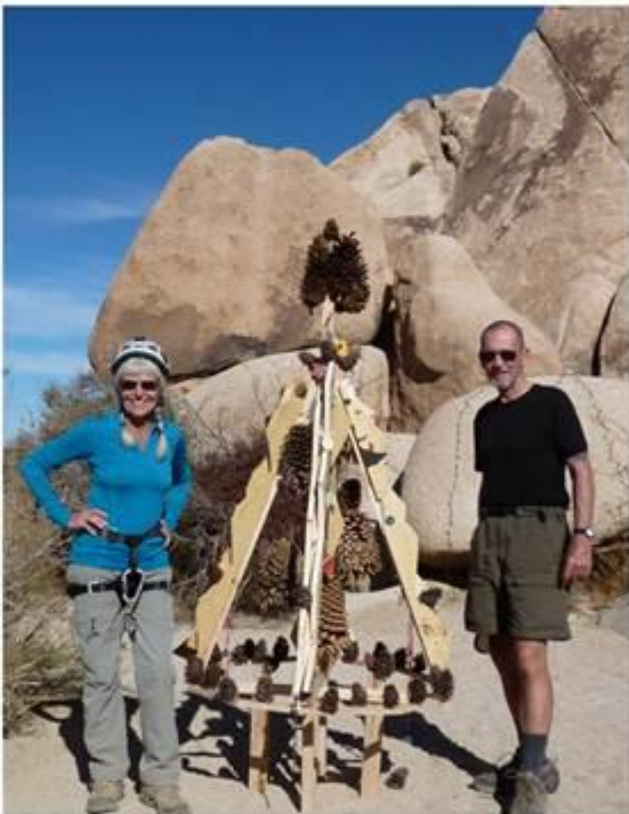
Joshua Tree NP on December 8, 2012