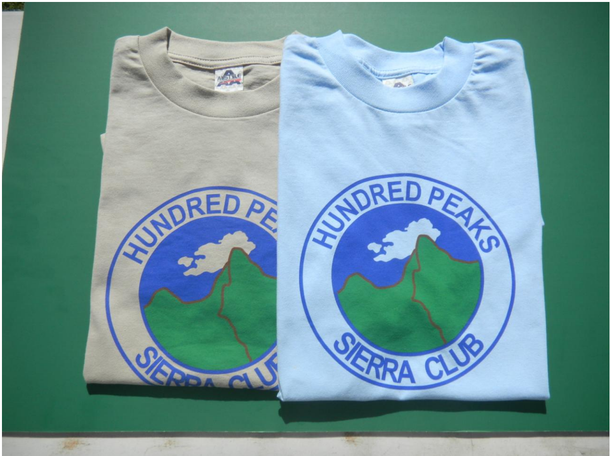
T - Shirts