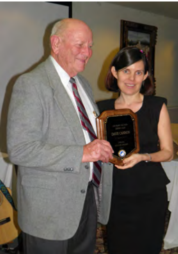
A Special Service Award for his help with ordering merchandise and setting up routes and waypoints for peaks on the HPS website.