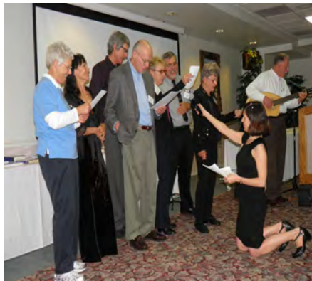
Songsters serenade the crowd with "The Happy Wanderer" and with an original peak register song