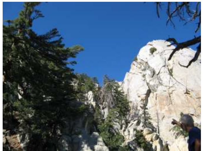
First glimpse of tram from the C 2 C trail.

miles, 10 hours." The reality is the reverse; it's ten miles from the parking lot to the upper tram station and probably eight hours at a leisurely pace. Above this point the trail is quite distinct, and route-finding is easy. The trail starts in the desert, and climbs all the way to alpine conditions. The trail does cross a broad gully near the top, and it's easy to follow. However, it is understandable that in icy conditions there this could become quite hazardous. But we had no such problems today.