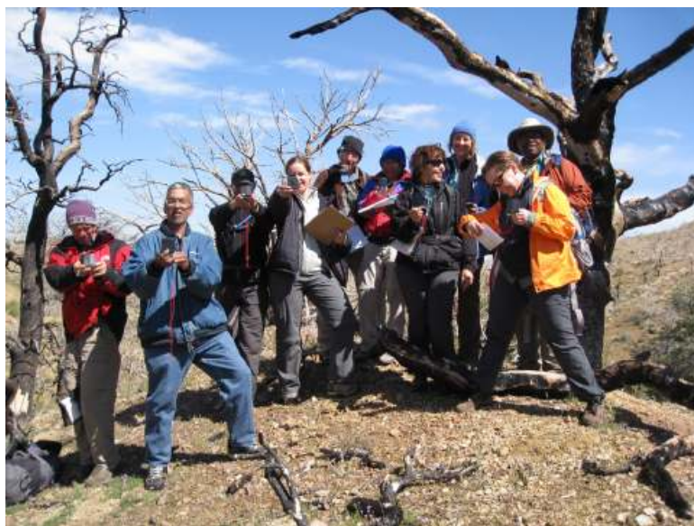
Navigation Fun at Mojave National Preserve - April 2011

Part 5 of our series on exploring the features of the National Geographic TOPO! software examines transferring waypoints between TOPO! and a GPS device.