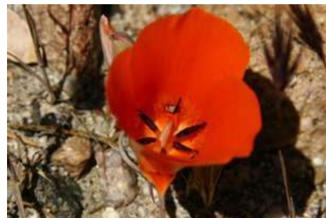
Desert Mariposa Lily

We had a wet winter so I'm hoping to see these special flowers again this summer. Please watch out for them and let me know if you see them, at ginnyh@ix.netcom.com .