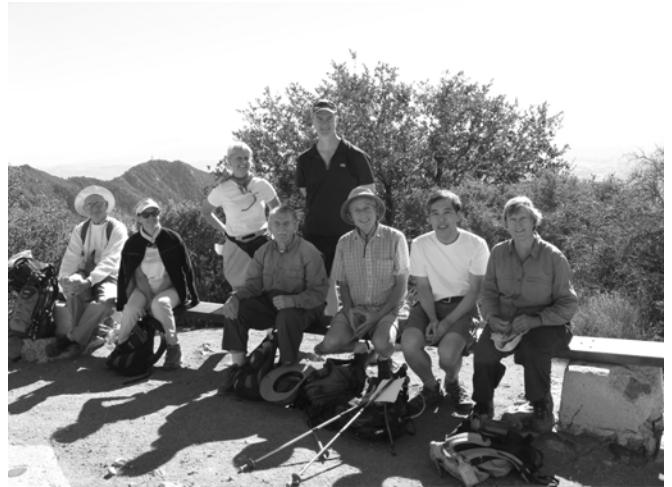
Group on San Gabriel Peak