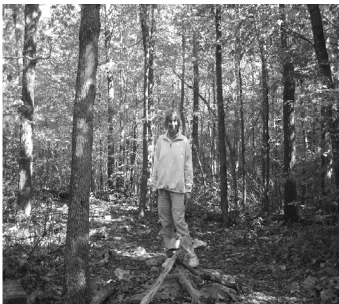
Trying to look at a view through the trees.

On my past two visits, I supplemented my