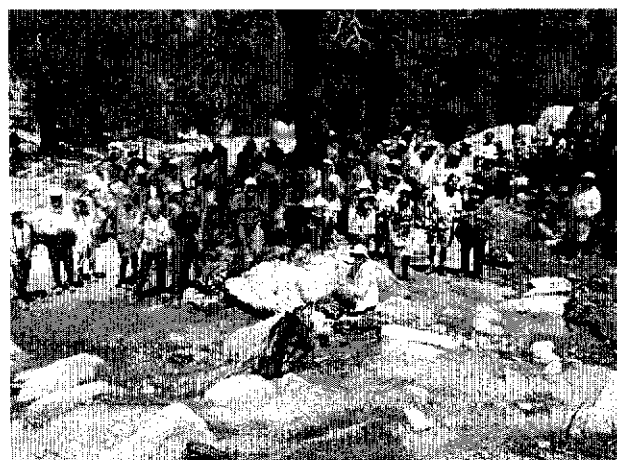
A view of the approximately 100 hikers assembled on the summit of Waterman, July 26, 2008.