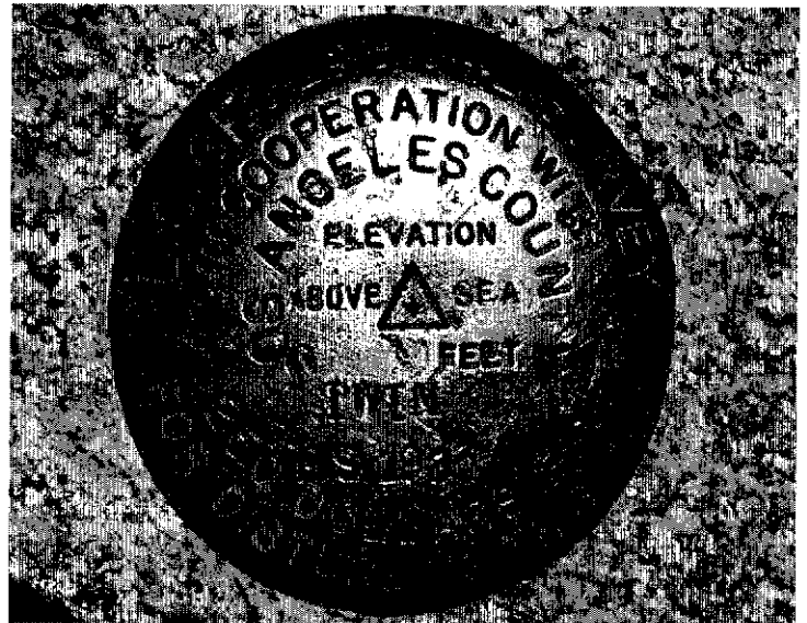
The bench mark on Mt Waterman.