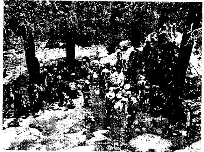
The scene on the summit of Mt. Waterman at this year's Waterman Rendezvous. Nearly 100 people attended the event.