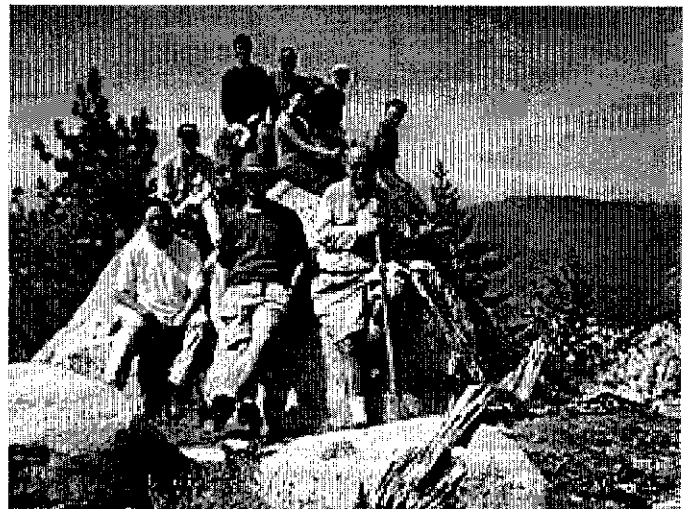
Hikers on the summit of Twin Peaks prior to the gathering on Waterman.