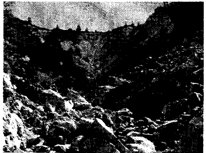
The head wall at Galena Peak

Kevin Dixon, HPS member, mountaineer from England presents " Climbing on Four Continents. " Climbs to Mera Peak in Nepal, volcanoes in Mexico, Mt Elbrus (Europe's highest mountain), and Antarctica's highest, Mt Vinson. Come meet your well-dressed hiking friends and socialize. Enjoy the friendly atmosphere at Les Freres Taix restaurant, centrally located at 1911 Sunset Blvd in the Echo Park area of Los Angeles. No host bar opens at 5:30 pm, dinner at 6:30 pm, raffles, awards, recognitions, program at 7:30 pm. Purchase raffle tickets in advance: three for $2 or ten for $5, when ordering tickets. (Warning: prices for raffles may be higher at the Banquet!) Send sase with check payable to HPS for $29 per person with choice of entrees— beef, chicken, fish, or vegetarian— before January 14 to reservationist David F Eisenberg, 510 N. Maryland Ave, #307, Glendale, CA 91206-2275.