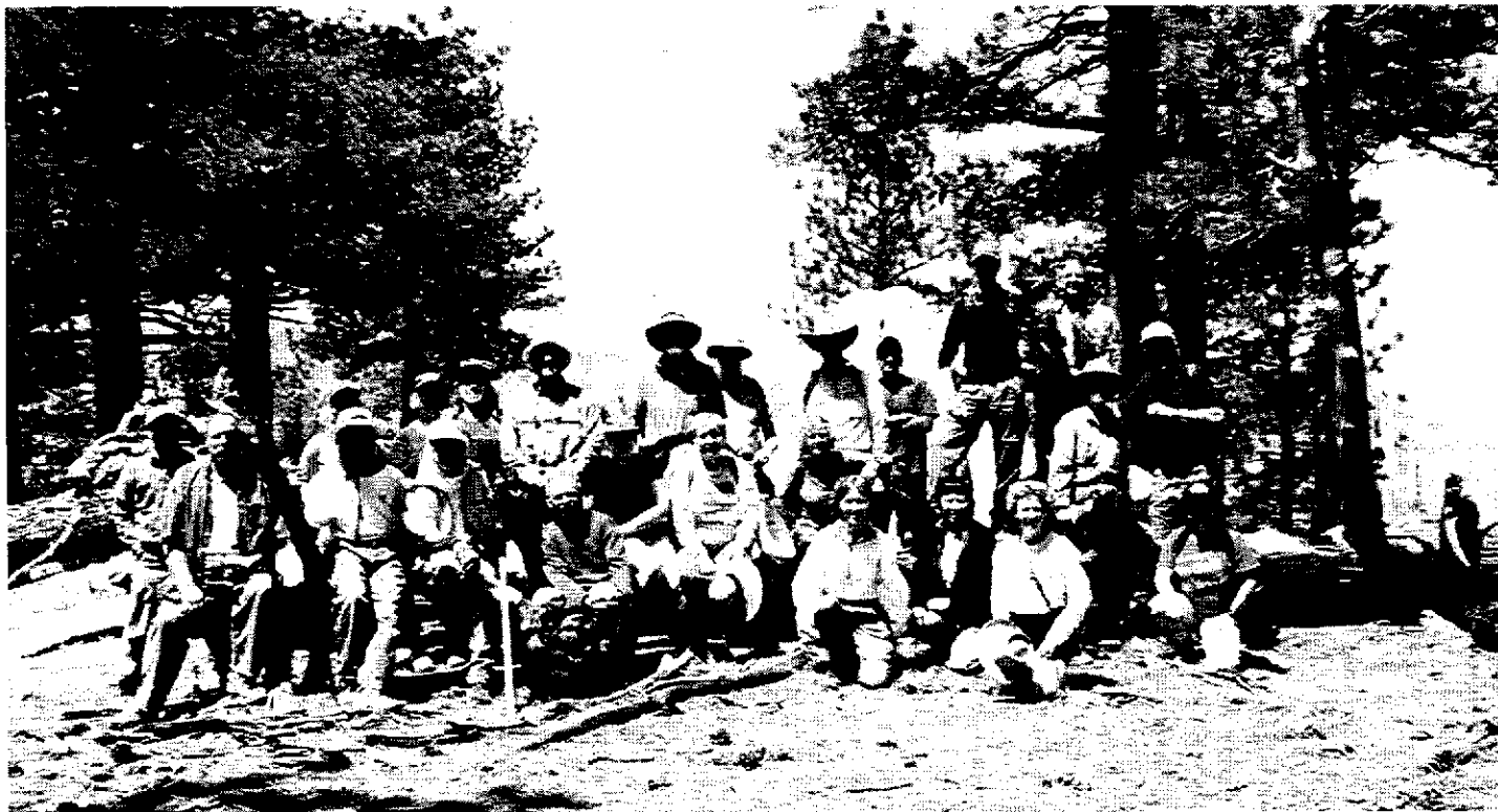
Hikers on Winston Ridge, April 28, 2001.

Thanks to all--on both hikes--for being great, friendly, cooperative groups!