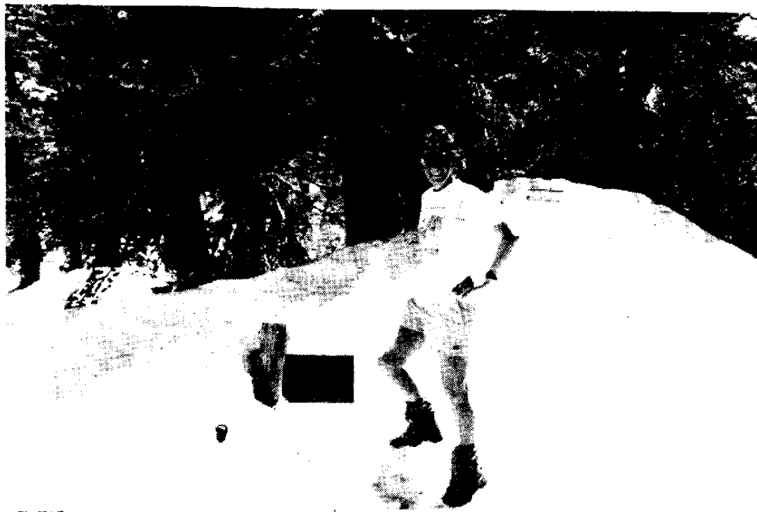
Top: Patty Kline at trail sign below San Jacinto Peak—Lots of snow on June 26, 1993