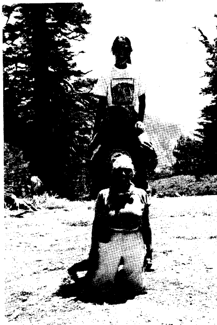
Left: Peak Chairs and Chair on Copter Ridge. August 7, 1993.