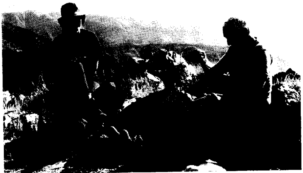
Joe Young and Wynne Benti atop Modjeska December 14, 1991—Joe's 46th Birthday

At 12:30 pm we headed north from the summit on to the main road and missed the overgrown firebreak heading toward the Modjeska/Santiago saddle. So we continued on the main road to the saddle, then took the trail up the south face of Modjeska to the southwest ridge, then proceeded to the summit. We arrived there at about 1:40 pm and relaxed until 2:30 pm. The weather was cool and clear - about as perfect as could be imagined.