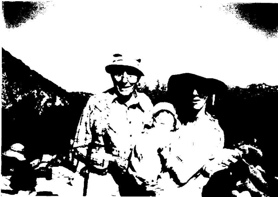
Three Generations of Peakbaggers on Mt Markham