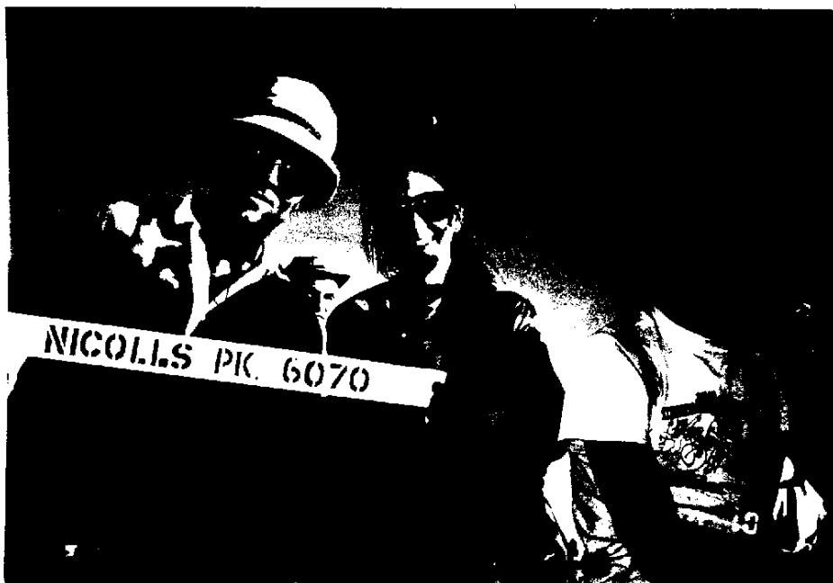
October 27 on Nicolls